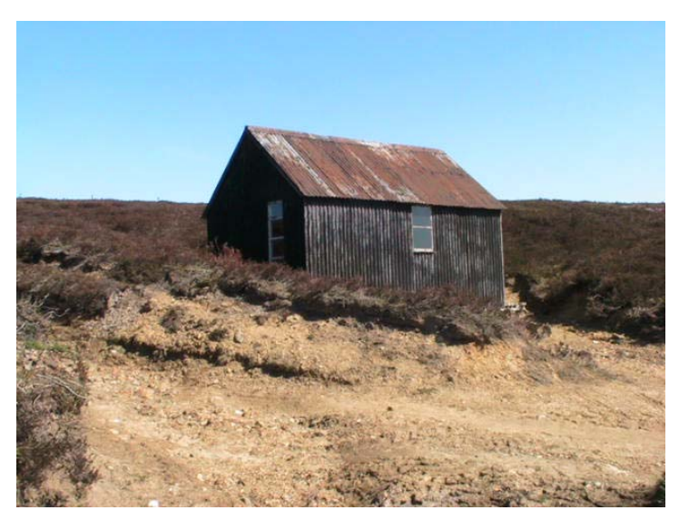
Fig. 2: Photo taken in a north east direction showing the depth at which the structure is burrowed into the hill and the existing track.

1. Retrospective planning permission is being sought for the retention of a lunch hut located on the side of a hill between the Hill of Rhinstock and the adjacent summit of Moss Hill. The Hut is positioned close to the main track and built into the hillside (see Fig 2).