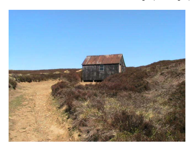
Fig. 3: Photo taken in a northern direction showing the Lunch Hut and the existing track.

2. The Lunch Hut measures approximately 4.5m in length, 3m in width and 3.4m in height and is constructed of corrugated steel which sits on wooden stilts in heather moorland surroundings (see Fig 3).